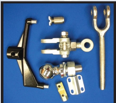
Stampings, castings and assemblies.

For more than 40 years , Porteous Fastener Company has been your supplier of high quality bulk and packaged fasteners.