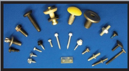
Endless variety of formed fasteners.