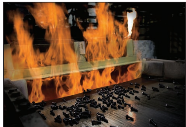
Parts entering the heat treat furnace