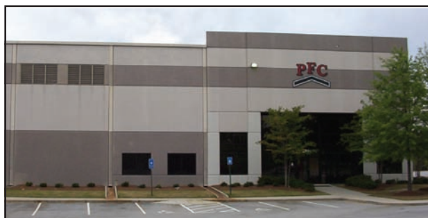
PFC S.E. Regional Distribution Center, Atlanta, GA