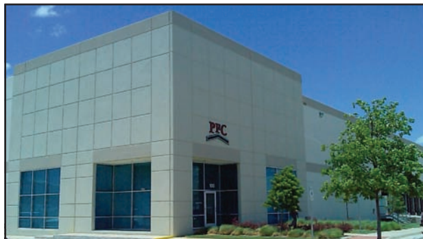
PFC S.W. Regional Distribution Center, Dallas, Texas