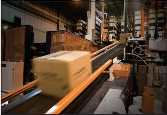
Finished boxes on auto-pack line heading for label and palletizing

estly, for many years we have worked with Nucor but just failed to carry that relationship far enough," he said. "Now with new major inventory dollar commitments, as well as the significant development of many new, larger distribution centers the past couple of years, we are able to expand the inventory and partner with Nucor to offer a higher service level at a more competitive price level. We are pleased that they have agreed to forming this new alliance, and it is just one more way we will continue to bring 'First Class Service' to our distributor partners everywhere."